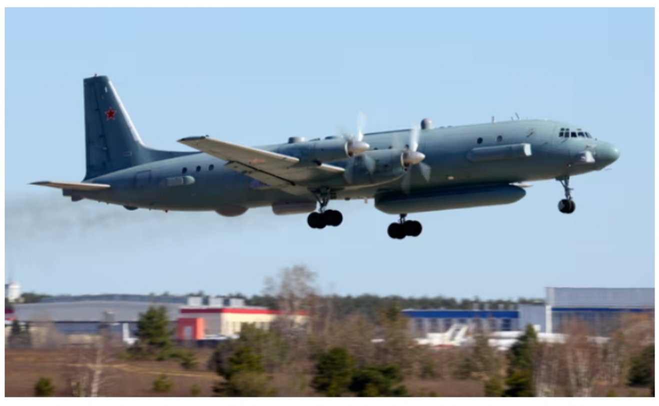
▲ An Ilyushin Il-20M 90924 reconnaissance plane takes off from Moscow.

Russian ministry accuses Israeli pilots of using aircraft as cover against missiles