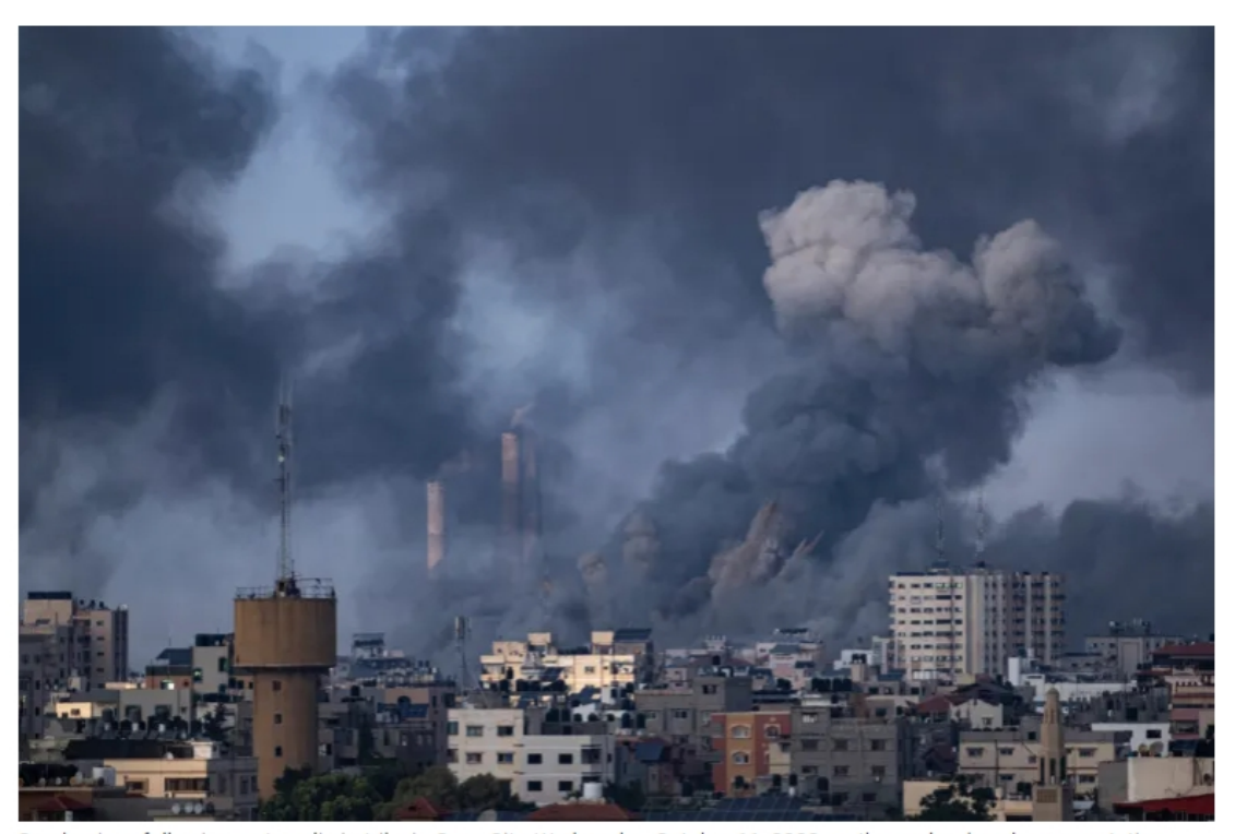
Smoke rises following an Israeli airstrike in Gaza City, Wednesday, October 11, 2023, as the enclave's only power station stopped working after Israel blocked supplies of fuel

Life-saving machines running on generators will soon stop working, amid Israel's refusal to allow fuel supplies into the enclave.